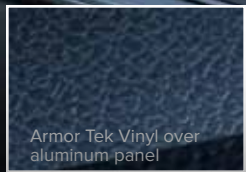
Armor Tek Vinyl over aluminum panel