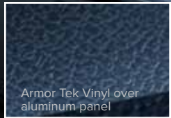
Armor Tek Vinyl over aluminum panel