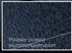
Powder coated aluminum extrusion